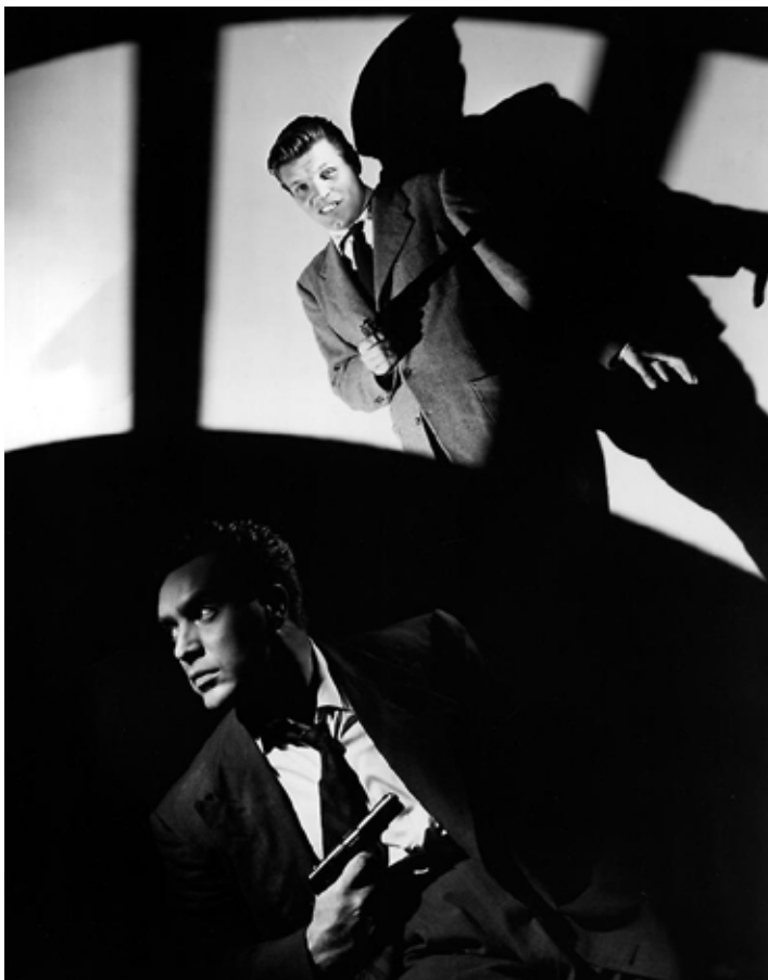
Brand X: a very cross Neville Brand plans to cross out a dying Edmond O'Brien in D.O.A.

As Chester, Brand owns some of [ D.O.A. 's] most unnerving scenes: jumping from behind a door with gun in hand, driving himself and Bigelow to a messy showdown, predaciously prowling the picture's dark city backdrops.