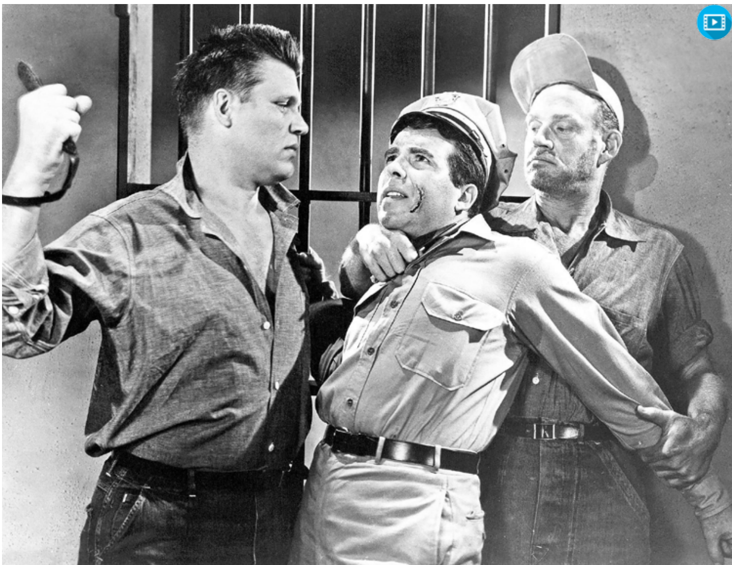
Rebellious inmates Neville Brand (left) and Dabbs Greer (right) freeze Paul Frees in his tracks in Riot in Cell Block 11

determined to voice his fellow prisoners' demands to the press and the public. He's a quintessential antihero, and Brand rightly received a BAFTA nomination for his performance.