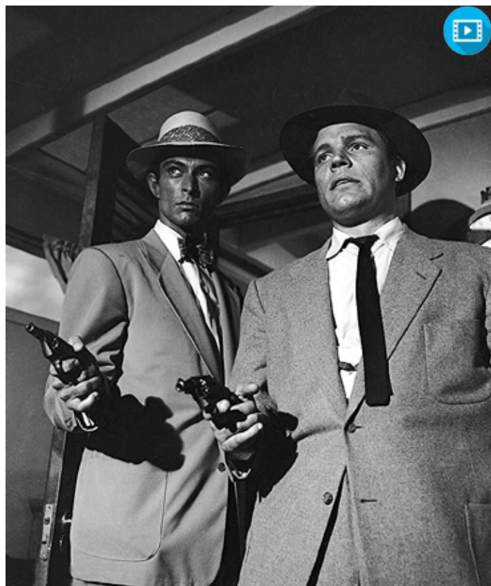
Thrill killers Lee Van Cleef and Neville Brand put a stare and a scare into a hapless victim in Kansas City Confidential

Several career defining performances would follow. Brand is the hot-headed, gum-chewing, gun-crazy Boyd Kane in Phil Karlson's heist thriller Kansas City Confidential (1952). Kane is the twitchiest in a trio of bank robbers that includes the skeezy Pete Harris (Jack Elam) and the greedy Tony Romano (Lee Van Cleef). As Kane, Brand veers in and out of control, delivering a masterfully modulated