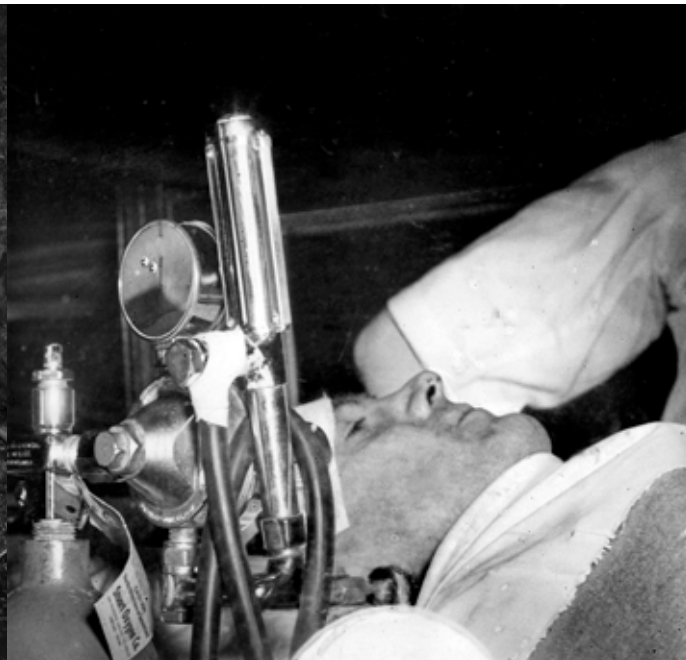
The July 1946 crash of the Hughes XF-11 reconnaissance plane prototype in Beverly Hills almost killed Howard Hughes; the accident would have long-term physical and psychological effects on the movie mogul and aviator

thing.” What accounts for that transformation? Was it his age and insecurity or something more?