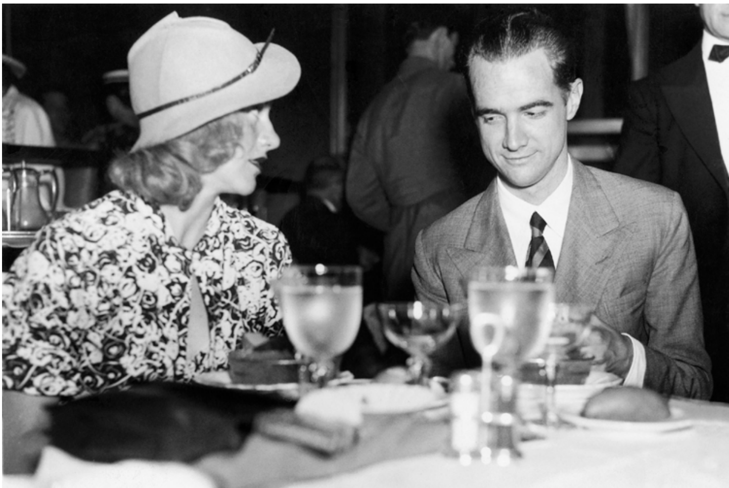
Howard Hughes cut a swath through Hollywood, his paramours including some of the silver screen's most famous faces like Katharine Hepburn, Bette Davis, and, shown above with Hughes, Ginger Rogers

was even more elaborate and controlling. What exactly would happen to a woman who signed a contract with him thinking she was about to become a star?