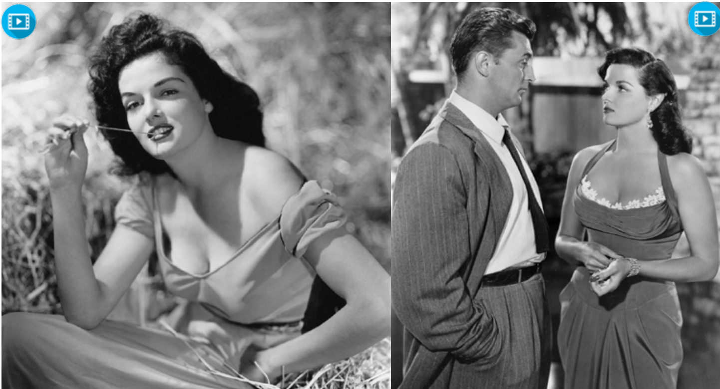
The tempest over Howard Hughes' censor-baiting build-up of his discovery Jane Russell's debut in The Outlaw (left) allowed Russell's career to flourish, as did her several films with Hughes favorite Robert Mitchum, including 1951's His Kind of Woman (right)

NOIR CITY: Jane Russell emerges as Seduction's secret heroine. Many of the actresses Howard Hughes had under contract resembled her physically, and you recount many incidents where she shows initiative and agency, even outwitting him. How was she able to forge her own persona while in his stable?